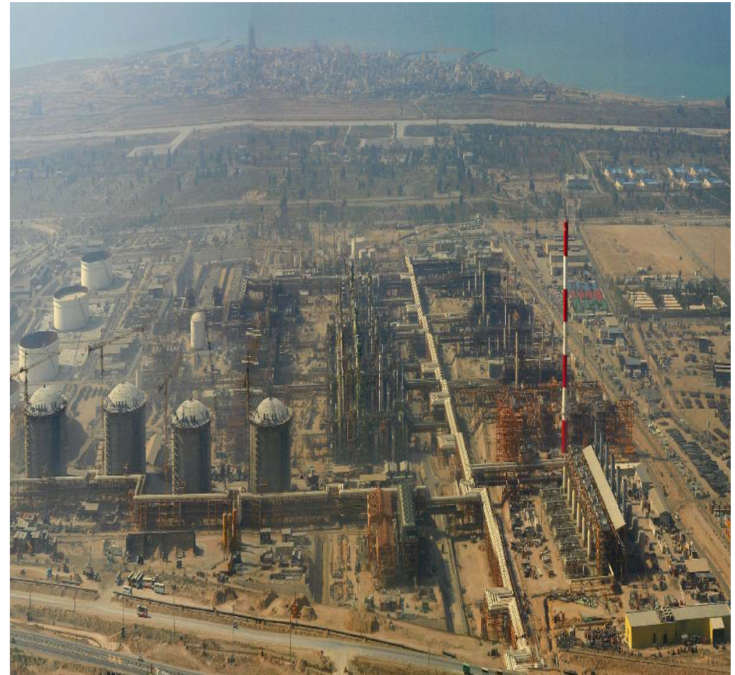
<Iran, SP 9~10 Project>